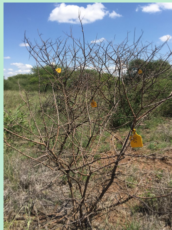
Acacia mellifera in Pienaarsrivier dead after a basal application

Turbodor 29 MPA can be applied throughout winter and the dry season, if the application is done correctly and if the plant is not entirely dormant