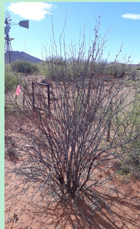
Dead Prosopis tree 3 months after a basal application in Beaufort